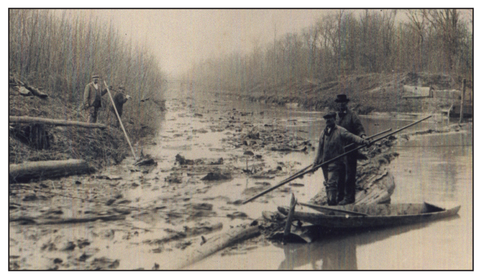
This 1918 photograph shows lumbermen floating logs along the Post Creek Cutoff, just south of Belknap. The cutoff, completed in 1916 as part of a series of drainage projects, divides the Upper and Lower Cache and has led to dramatic alterations in the flow of the river.

By 1900, Belknap had become one of the county's busiest industrial centers, with a population of 800. Farmers