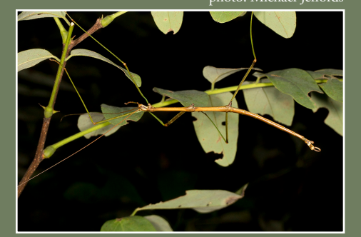
Can you spot the male walking stick above?

Michael and I head out to spotlight hike one autumn evening near the Wolff Wetlands, hoping to find walking sticks. Prior to our foray, we meet new wildlife biologist Cortez Rohr, who says the best place he ever saw walking sticks was in the crop of a wild turkey. Walking sticks are a favorite food of turkeys and their crops can contain a dozen or more. Walking sticks are curiosities that the average person will likely never see, due to their excellent camouflage (stick-like bodies) and habits. They feed at night and rest during the day, moving very slowly and often staying motionless for long periods of time.